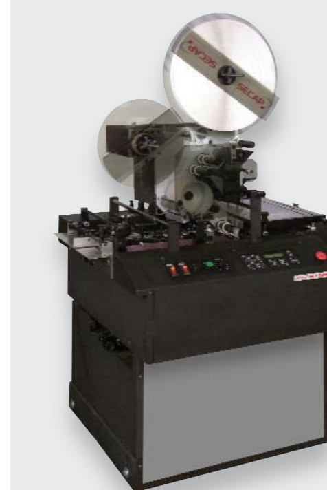
High capacity production tabber.

Add a heavy duty production Tabber-Labeler-Affixer to complete your mail-stream process with an in-line or off-line production tabber. Accurate, consistent placement of single, double or triple tabs on the left or right side of your mail piece. Configuration solutions available for toe and heel tab requirements.