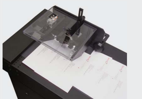
Close up of the UltraSort™ conveyor. Automatically creates tray breaks for improved separation and material handling.

QuikJet conveyors improve material handling and air drying of addressed material. Choose either the standard conveyor or UltraFeed conveyor. Both conveyors feature a wide belt design to handle glossy and coated stock at high speeds for superior material handling. Available in either 6' or 9' lengths.