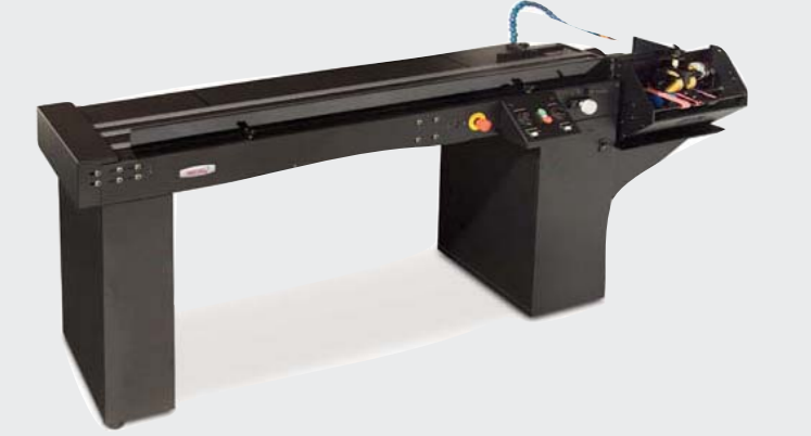
UltraFeed™ high capacity feeder available in 6' and 9' lengths.

The UltraFeed high capacity feeder delivers maximum capacity handling up to 4,500 #10 envelopes (9' UltraFeed) at a time. Having an inline feeder reduces operator intervention and increases productivity. The feeders synchronize with the vacuum transport base for increased efficiency.