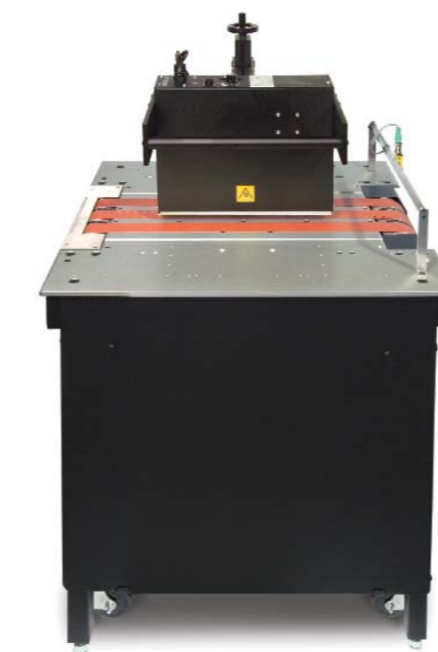
Dryer base available in 20", 30", or 36" length dependent upon your requirements.