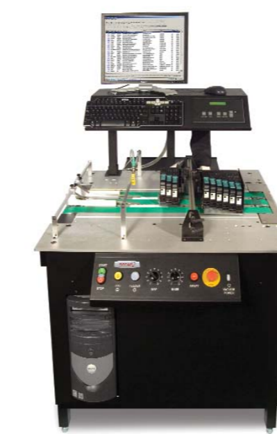
QuikJet 36 configured with 4.5" of print.