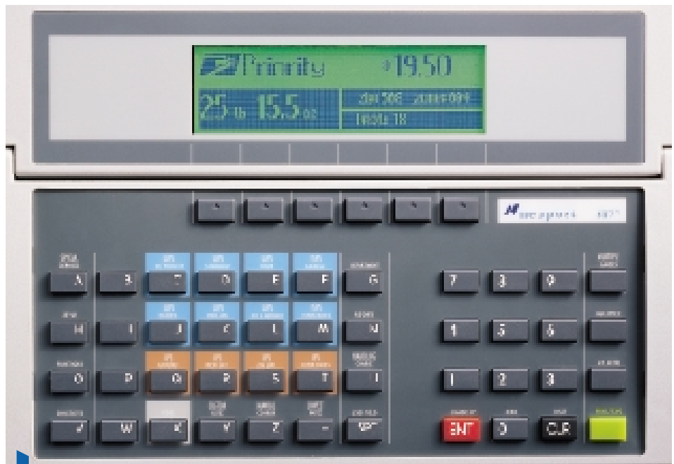
Neopost features you can see and touch. The color coded keyboard and easy to read display make mailing fast and accurate.