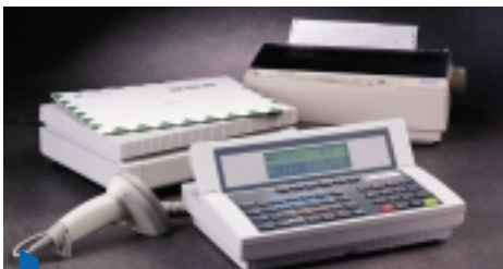
The Advanced Mail Accounting option offers hard copy reports, and mail processing can be further sped up by adding the optional barcode reader.