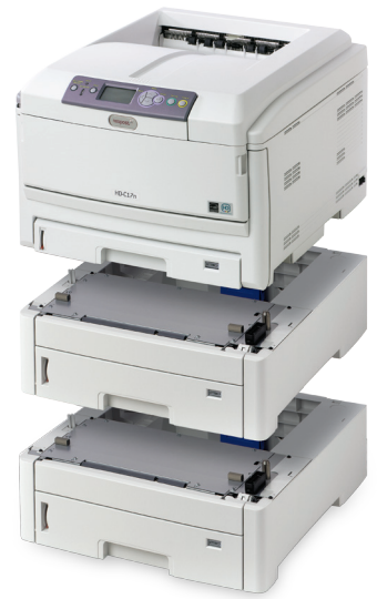
Maximize your productivity with additional paper trays

Warranty: 3-Year limited warranty with Priority Exchange service for the first year, 5-Year LED printhead warranty