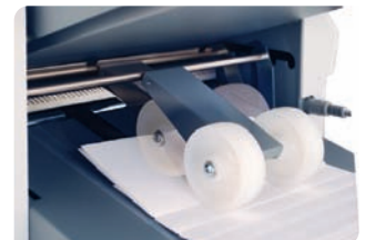
Automatically adjusting stacker wheels to accommodate various fold types